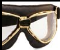
1180 BROWN LEATHER Brass

LENSES: Cylindrical lenses that are crafted from the highest quality scratch-proof polycarbonate. The strong, light lenses provide a high definition view and ultimate optical comfort without distortions. The lenses offer 100% UV protection.