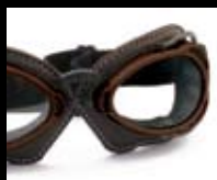
1176 BLACK LEATHER BROWN SEW Dark Brown

LENSES: Cylindrical lenses that are crafted from the highest quality scratch-proof polycarbonate. The strong, light lenses provide a high definition view and ultimate optical comfort without distortions. The lenses offer 100% UV protection.