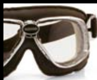
1151 BROWN LEATHER Chrome