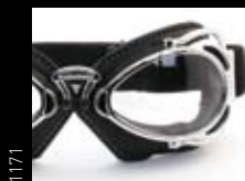
1171 BLACK LEATHER WHITE SEW Chrome

ELASTIC STRAP: An adjustable length elastic strap with an anti-slip strip ensures the strap does not move on the helmet.