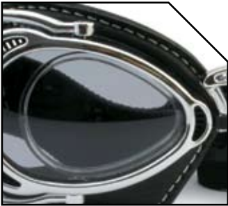
Chrome prescription inner frame

DOUBLE FRAME: A double crush-proof plastic frame provides twice the protection and durability.