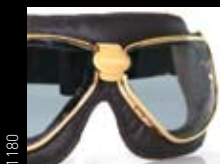
1180 BROWN LEATHER Brass