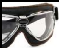
1173 BLACK LEATHER ORANGE SEW Chrome

LENSES: Cylindrical lenses that are crafted from the highest quality scratch-proof polycarbonate. The strong, light lenses provide a high definition view and ultimate optical comfort without distortions. The lenses offer 100% UV protection.