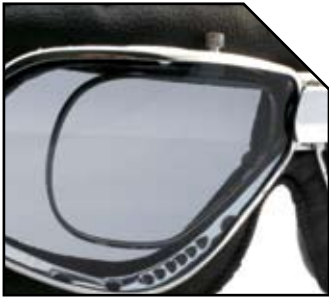
Chrome prescription inner frame

FRAME: Designed for durability and high performance in all weather conditions.