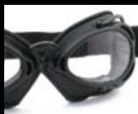
1170 BLACK LEATHER BLACK SEW Black Matt