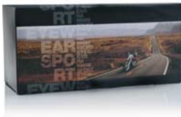
CASE: Cardboard case available in M, XL sizes