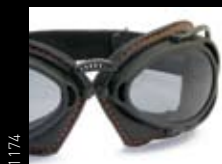
1174 BLACK LEATHER ORANGE SEW Black Matt