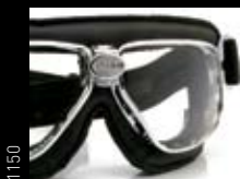
1150 BLACK LEATHER Chrome

ELASTIC STRAP: An adjustable length elastic strap with an anti-slip strip ensures the strap does not move on the helmet.